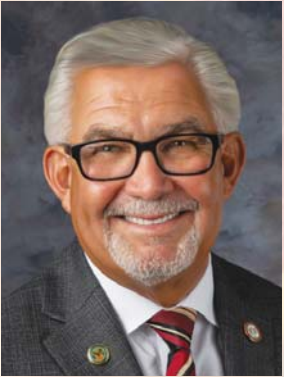
Mayor Greg Cummings