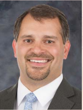
Mayor Pro Tempore Channing Jones