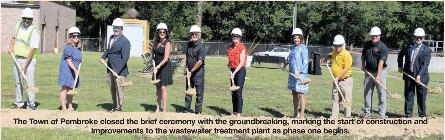
The Town of Pembroke closed the brief ceremony with the groundbreaking, marking the start of construction and improvements to the wastewater treatment plant as phase one begins.